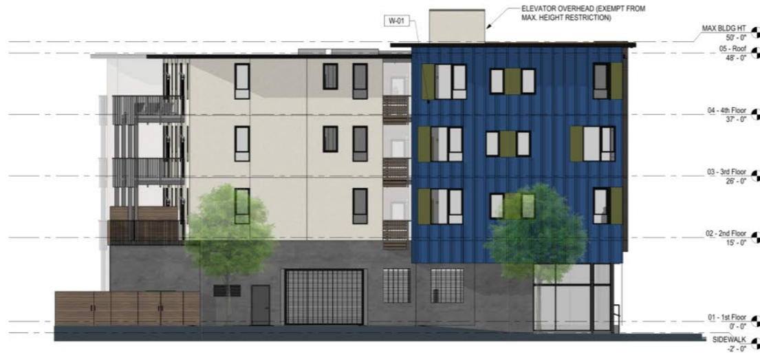
2 NORTH ELEVATION A201 1/8" = 1'-0"