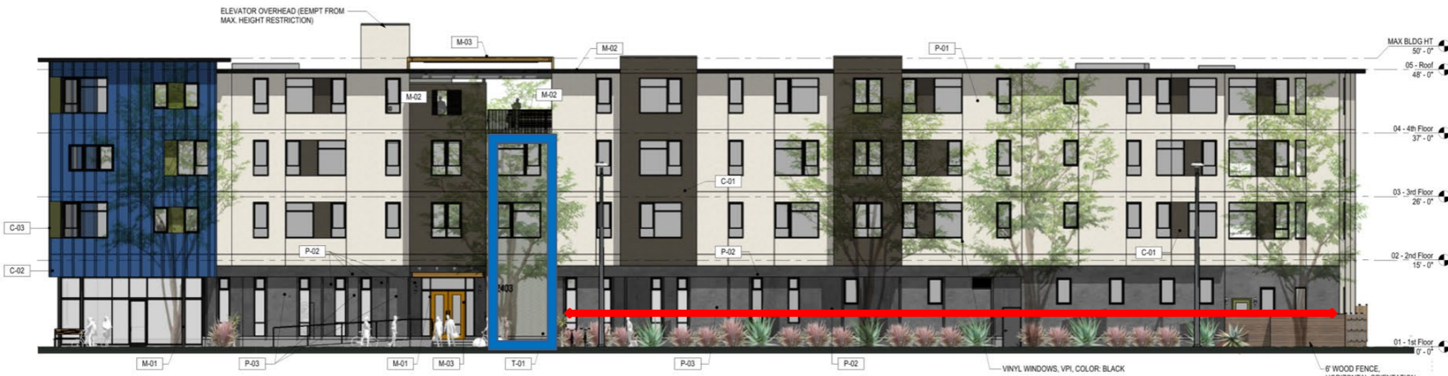
1 WEST ELEVATION SAN PABLO ABE A201 1/8" = 1'-0"

Could potentially use this tiled wall as well, 1-3 stories